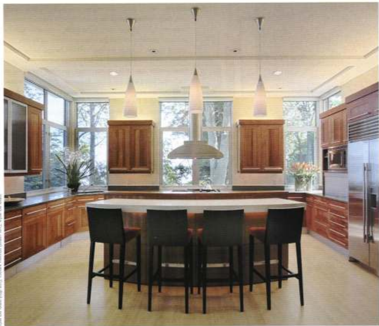
Open On Main (top left); EdMark Interiors Design, LLC; Open On Main

Critical to the family was creating a space where children are welcome and all ages can gather. "This house is very much about the kids," the homeowner says. "Casual, not opulent and kid-friendly." An open plan on the first floor where the living area, kitchen, screen porch and outdoor terrace flow together facilitates